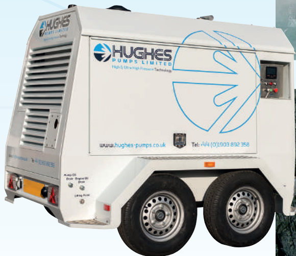
Ultrabar 30 DRT(4), 24lpm at 3000bar