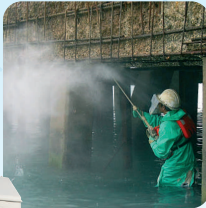
Concrete cutting - 1000 bar