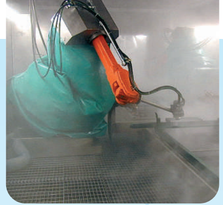
Robotic cleaning of skids at automotive plant - 900 bar.

High capacity water filters and stainless steel suction line fittings are used as standard and boost pumps fitted for higher pressure applications. Shutdown switches are fitted where necessary to monitor various pump and prime mover functions.