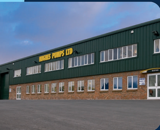
New Hughes Pumps factory constructed in 2004