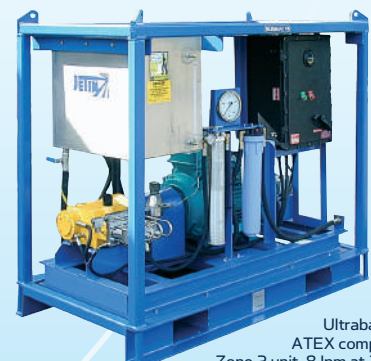
Ultrabar 10, ATEX compliant Zone 2 unit, 8 lpm at 2100

Backed by a comprehensive spares stockholding, we have dedicated Service Engineers who travel nationally and internationally keeping our pumps running round the clock. We also work closely with our overseas agents who have been trained in the selection, operation and maintenance of our product range ensuring they can provide the vital after sales service demanded by today's fast moving industry.