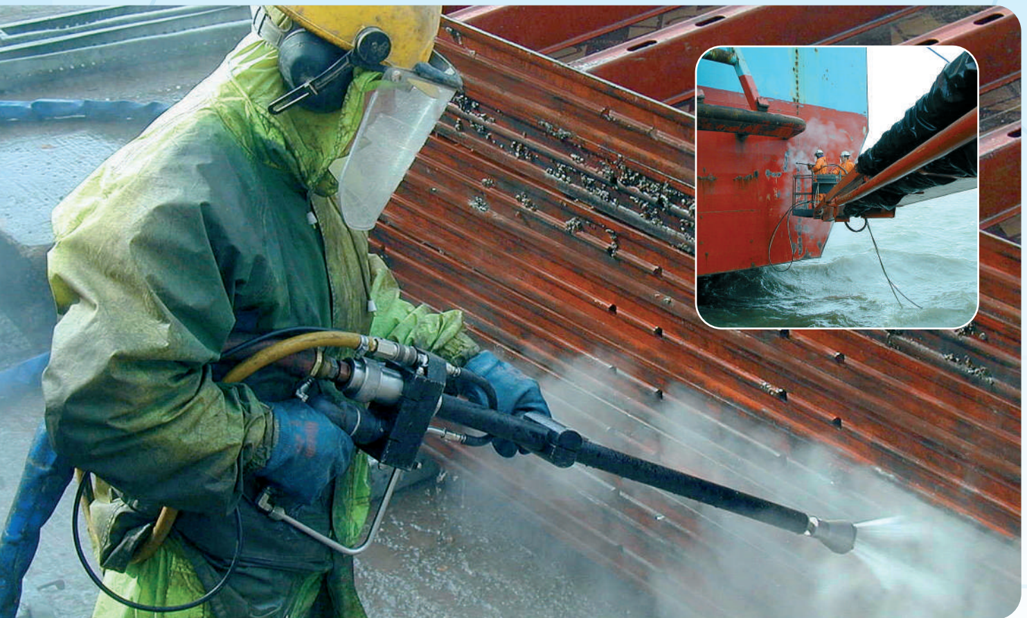
Main Picture: Stripping concrete from formwork at 2500 bar Inset: Surface preparation, shiprepair at 3000 bar