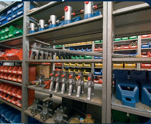
Comprehensive stock levels of accessories & spares