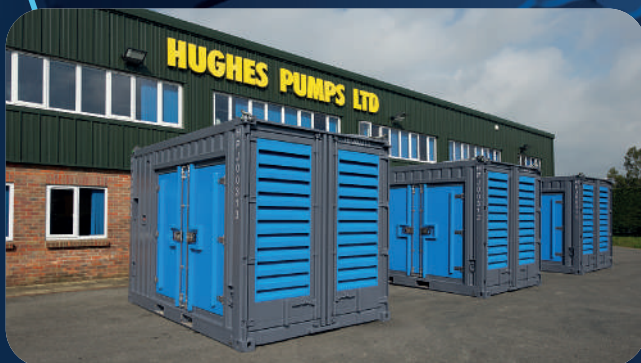
DNV 2.7-1 containerised units

The chart above shows extreme pressure/flow combinations with smallest & largest plungers fitted. All pumps have a range of plunger sizes other than the Ultrabar 10 & 15.