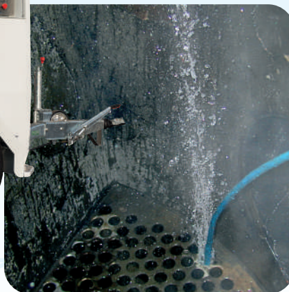
Heat exchanger cleaning - 800 bar